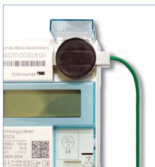
IR scanner for energy meters