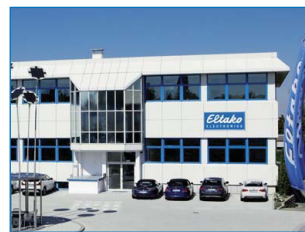
Distribution centre and head offices in Fellbach

In line with the importance that electronics have assumed in the company turnover, the Eltako logo was changed to include the internationally understandable word "ELECTRONICS". Although electromechanical switchgears are produced in high numbers, electronics cover more than 80 percent of total turnover.