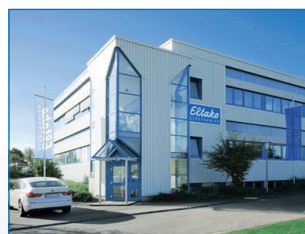
Central warehouse and electromechanics production in Lossburg