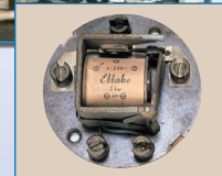
One of our first impulse switches