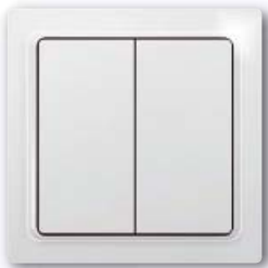
Wireless pushbutton with double rocker