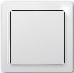
Wireless pushbutton with rocker