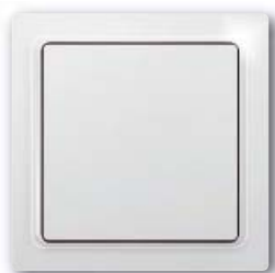
Wireless flat pushbutton with rocker