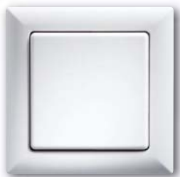
Wireless pushbutton with rocker