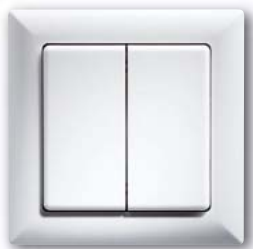
Wireless pushbutton with double rocker