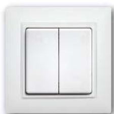
Wireless pushbutton with intermediate frame and double rocker (without frame)