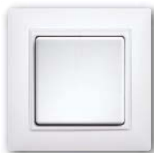
Wireless pushbutton with intermediate frame and rocker (without frame)