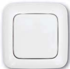
Wireless pushbutton with rocker (without frame)