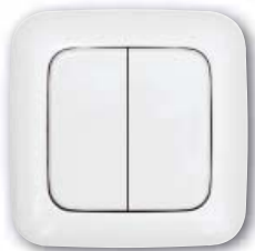
Wireless pushbutton with double rocker (without frame)