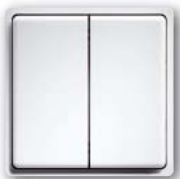
Wireless mini pushbutton with double rocker