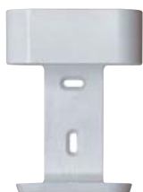
wall holder WHF-al

Double rockers laser engraved page 8-15.